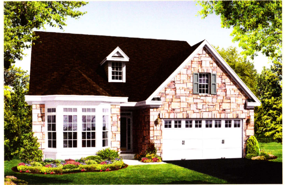
ELEVATION C4 Shown With Optional Stone and Dormer

K. HOVNANIAN'S® FOUR SEASONS An Active Adult Community