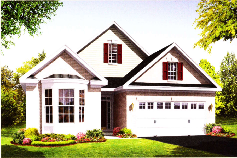
ELEVATION B4 Shown With Optional Brick